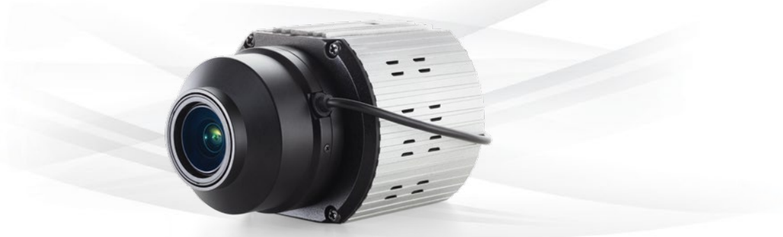
Lens Sold Separately

8.3 Megapixel (MP) H.264 True Day/Night Indoor Box-Style IP Camera with SNAPstream™ (Smart Noise Adaptation and Processing), NightView™, and WDR (Wide Dynamic Range)